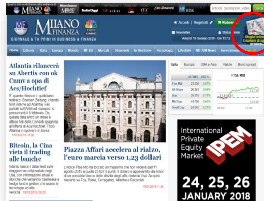
1. TICKER CLICCABILE SULL'ADV

45.300.000 monthly impressions (per page)*