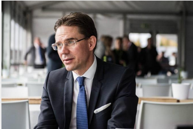
European Commission Vice-President and former Finland Prime Minister

Most important banks and the financial environment. Advantages and How to set up a company in Finland.